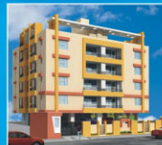
Sunshine Orchid Shri Gopal Nagar