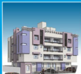
Sunshine Vrindavan Shri Gopal Nagar